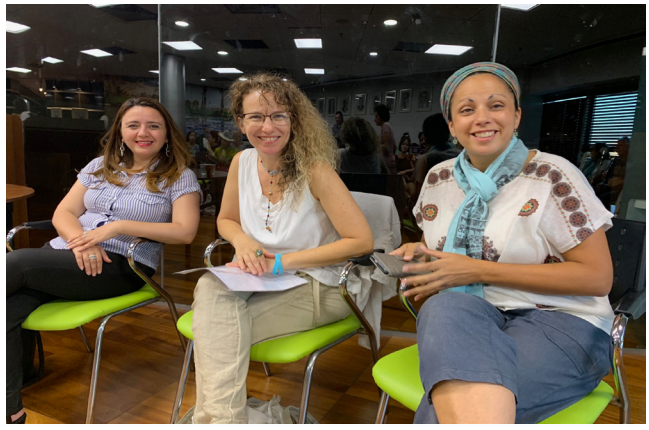
Women Wage Peace Event in Rishon Lezion