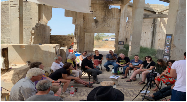
The Lighthouse is Here Kibbutz Be'eri