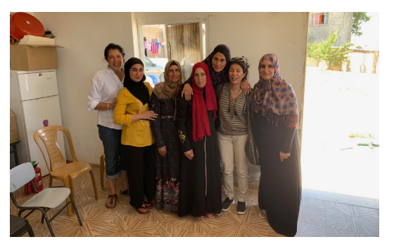
Taghyeer's women's group in a village called Jubet Adh Dib