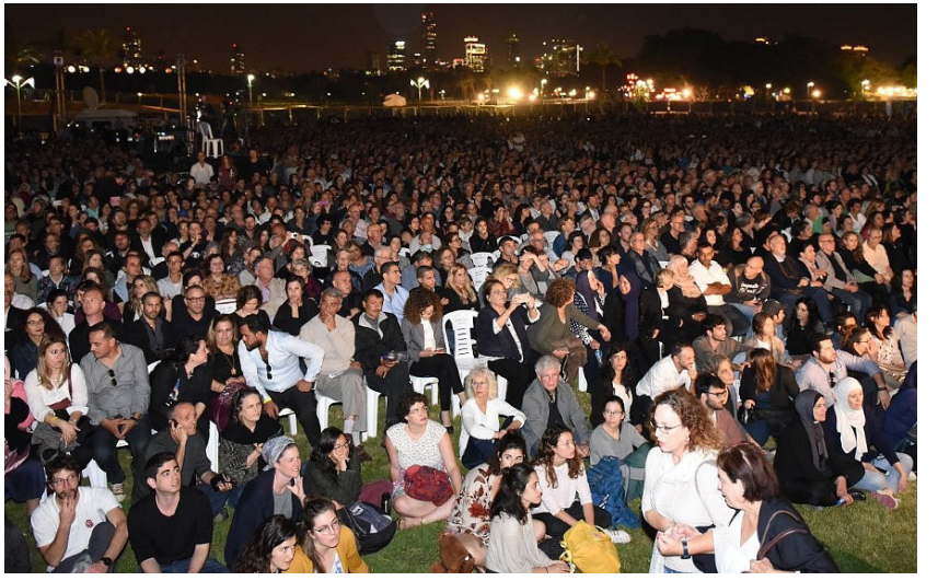
(CFP – Alternative Memorial Ceremony in Tel-Aviv, May 2019)

This ceremony celebrates togetherness and hope. In May 2019, more than 6000 people participated; a significant growth from 15 years ago when there were only 50!